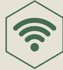
Wi-fi (Selected Zone)

Presenting Thoughtfully Planned Amenities For You To Live, Learn, & Play