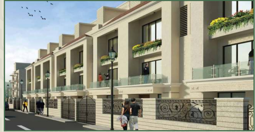
Viceroy Row House