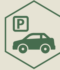
Ample Car Parking