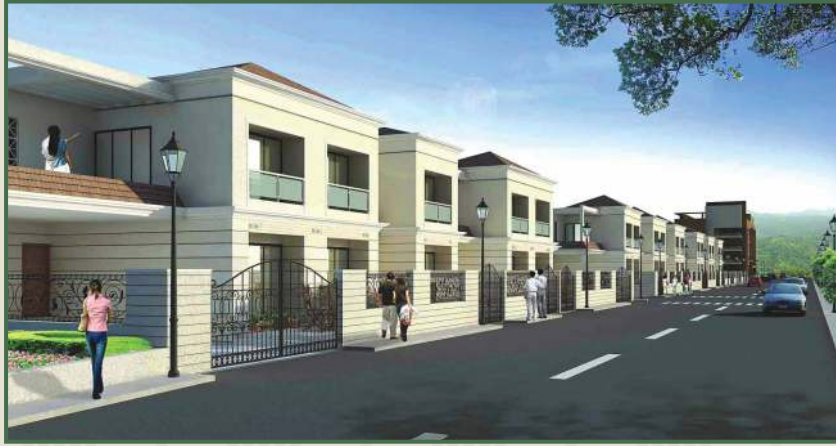
Kimberly Row House